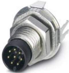
Sensor/actuator flush-type plug-in connector, plug, 8-pos., M8, rear/screw mounting with M8 fastening thread, with straight solder connection

Please be informed that the data shown in this PDF Document is generated from our Online Catalog. Please find the complete data in the user's documentation. Our General Terms of Use for Downloads are valid ( http://download.phoenixcontact.com )