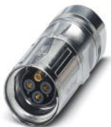
Cable connector, straight, SPEEDCON locking, M17, Number of positions: 5+3+PE, Type of contact: Socket, Crimp connection, shielded: yes, Cable diameter: 5 mm...8 mm

Please be informed that the data shown in this PDF Document is generated from our Online Catalog. Please find the complete data in the user's documentation. Our General Terms of Use for Downloads are valid ( http://phoenixcontact.com/download )