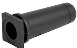
Cable Guard KT14 PVC Cable Guard for rewireable connectors